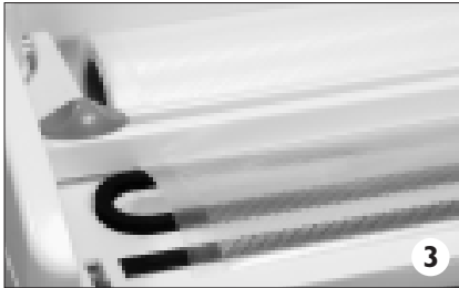
Place Bag on Sealing Strip