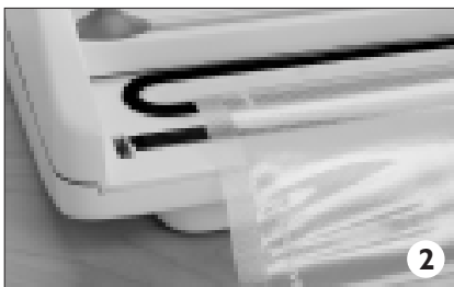
Place Bag in Vacuum Channel