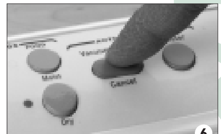
Press Vacuum & Seal Button