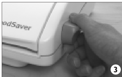
Close and Latch Lid