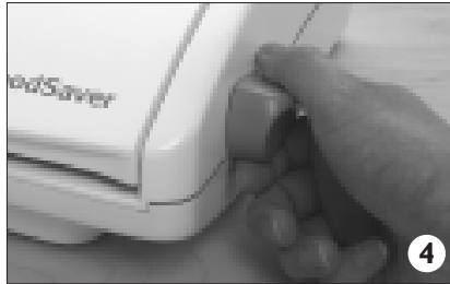
Close and Latch Lid